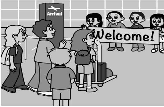
At the airport