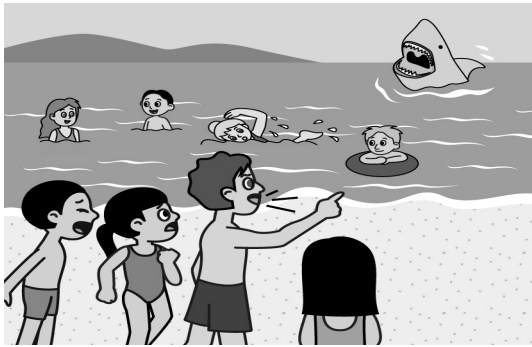
Something else that happened!