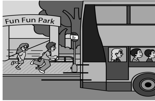
Some students had to run for the bus!