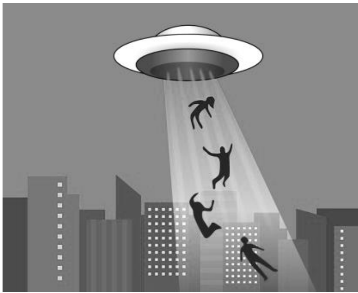
Here to help?