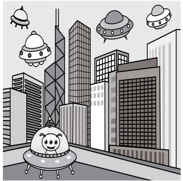
Aliens have landed!