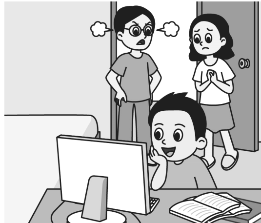
SURFING THE WEB