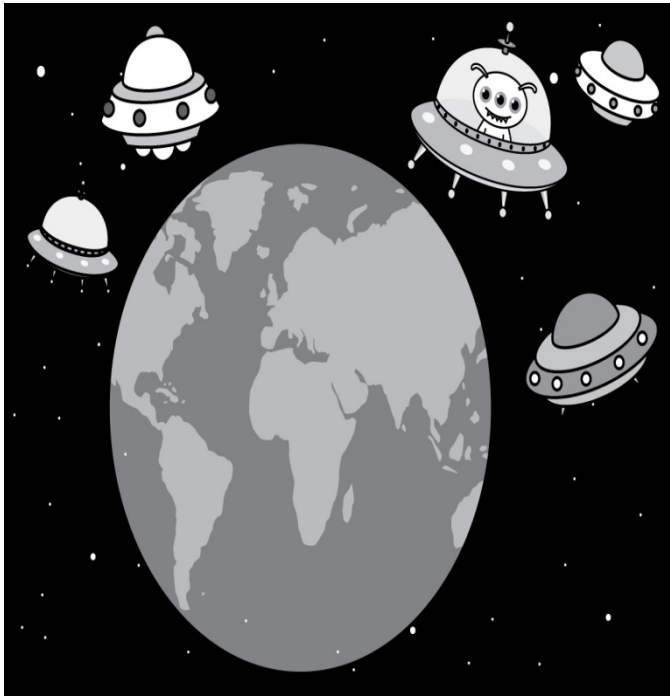
Planet Earth may be in danger!