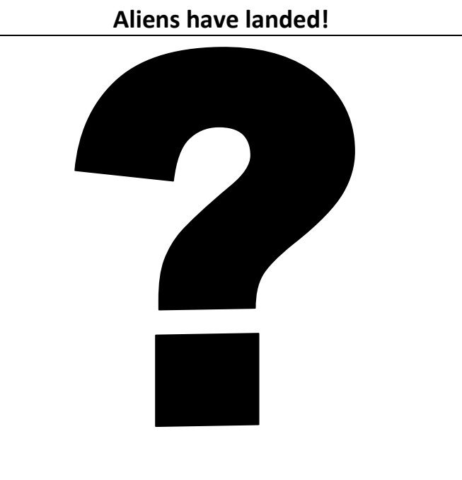
END OF PAPER