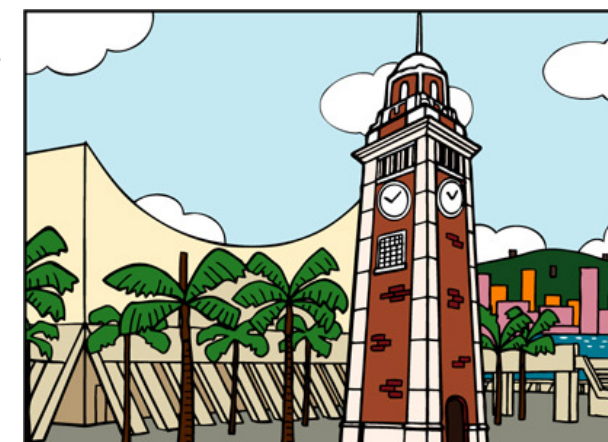
Tsim Sha Tsui