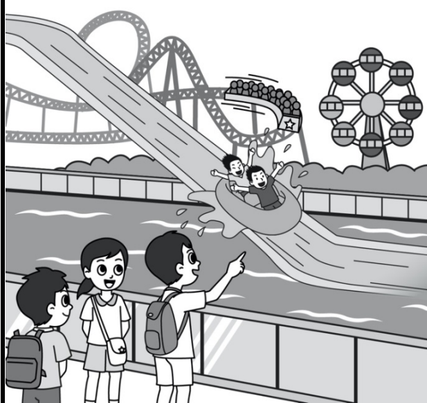
amusement rides (e.g. Ferris wheel and water slide)