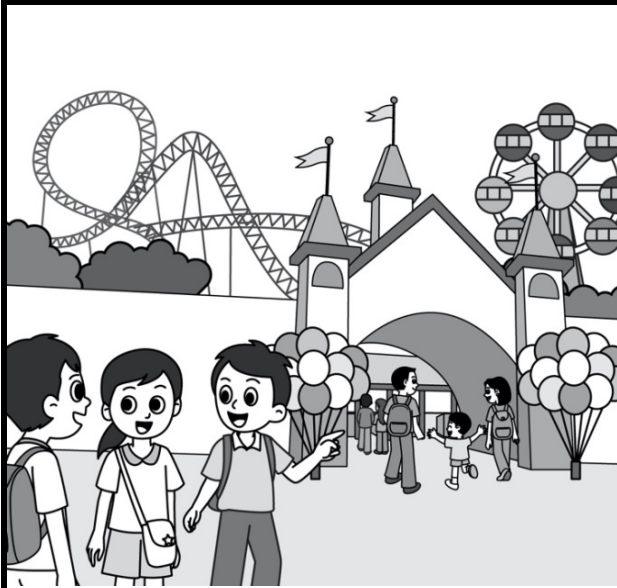
a theme park adventure with friends